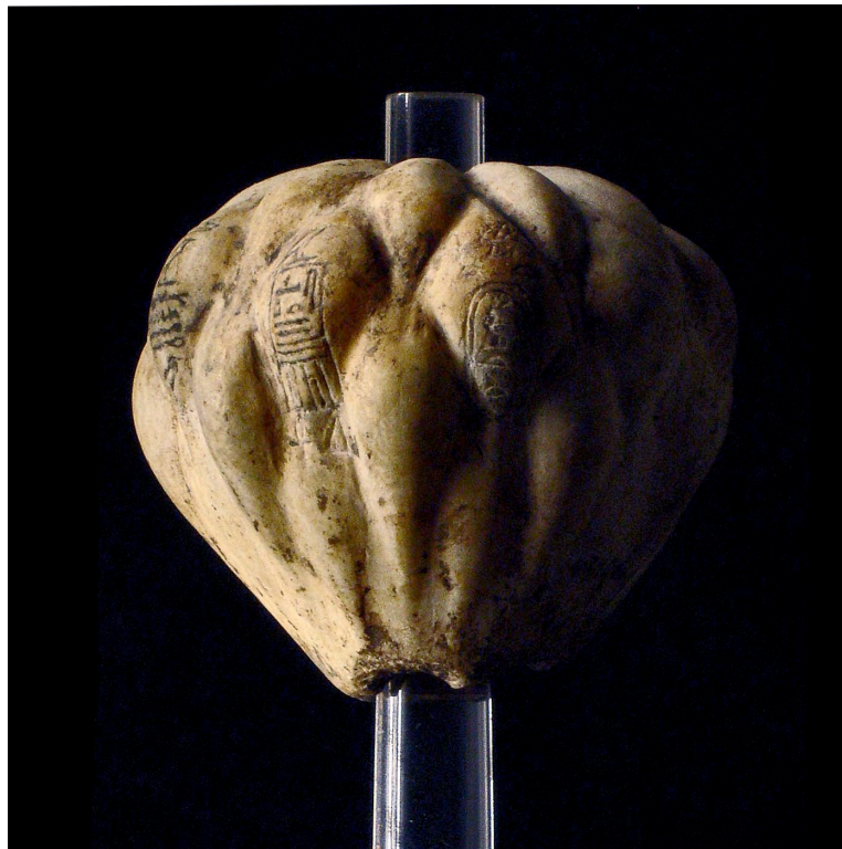
Fig. 1. An example of Teti's hard-tipped leaf scaled maceheads. Saqqara, Imhotep Museum (no inventory number stated).

the king ( tti/s3 r' tti ) too 7 . No published pictures and descriptions of the Teti maceheads offer any trace or mention of their original colour (if they were ever painted).