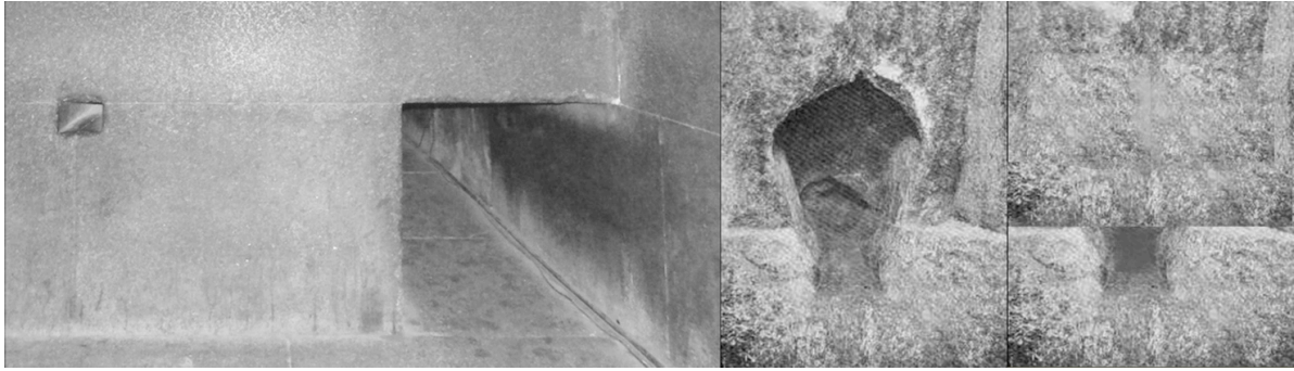
Fig. 1. From left to right: the northern shaft inlet of the King's chamber; the desecrated southern shaft inlet; and the southern shaft inlet as it probably looked originally.

Petrie 43 estimated the height of this course line of bricks above the floor: