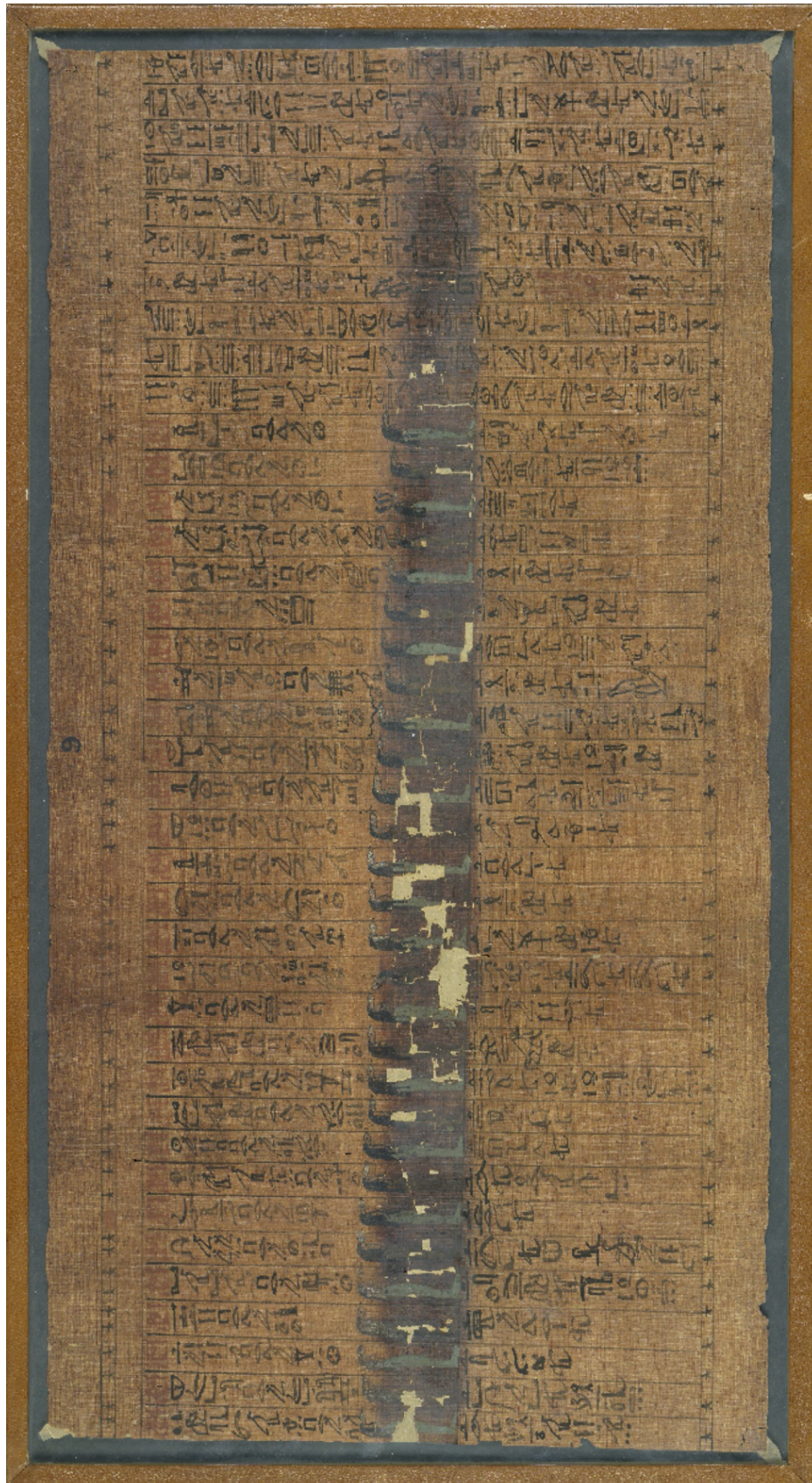
Fig. 2. Papyrus of 'Imn- ḥtp (BM EA 10489, 9 Recto).