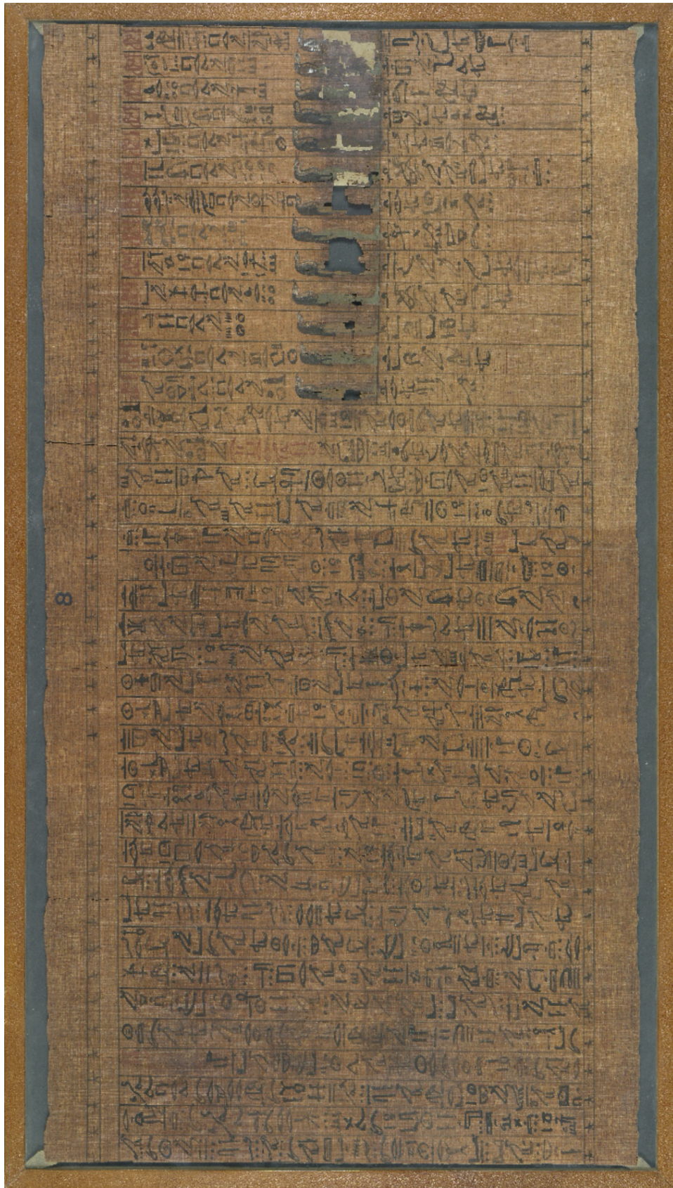
Fig. 1. Papyrus of 'Imn- htp (BM EA 10489, 8 Recto) (Courtesy of the Trustees of the British Museum).